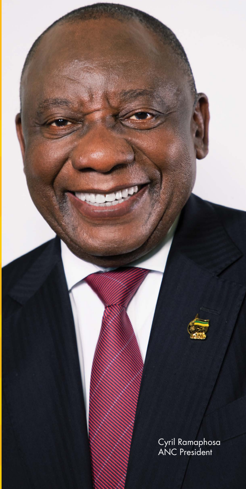
Cyril Ramaphosa ANC President