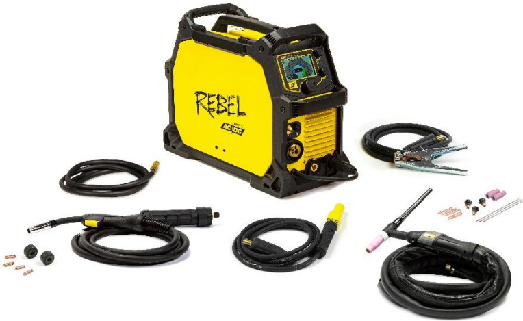
Rebel EMP 205ic AC/DC and accessories.

We made the impossible possible with the first-ever portable, all-process machine, complete with MIG, Flux-Cored, MMA, DC TIG, and now AC TIG capabilities, which means – yes – it TIG welds aluminium. It is a TRUE all-in-one welding system that delivers best-in-class performance in each process in the most portable, durable, go anywhere, weld anything industrial package on the market today.